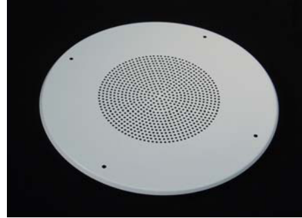
MODEL 8WB - Steel