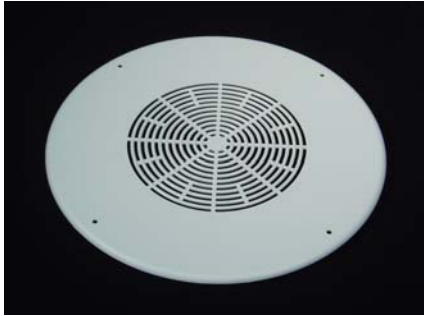
MODEL 8PBL - Plastic